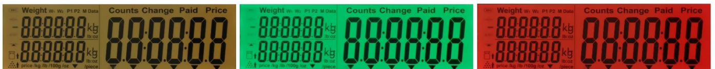
Adjustable Tri-Color Check Result Backlight

The wide-angle LCD plus the Tri-Color backlight display weight, unit weight, number of pieces and other operation status / information and check results crystal clear even in dim and dark environment.